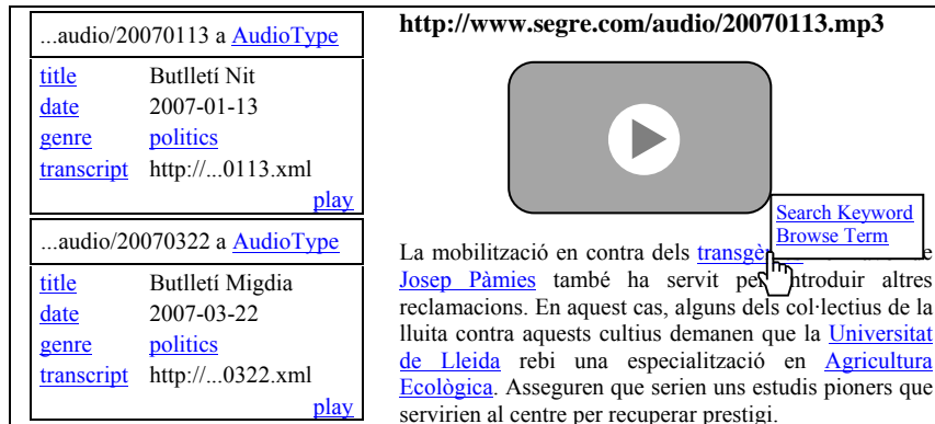
Fig. 3. Metadata view (left) and transcript view (right) available through the "play" service